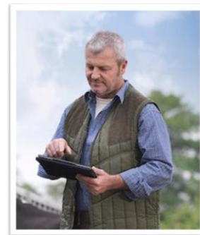
VEAL QUALITY ASSURANCE CERTIFICATION PROGRAM