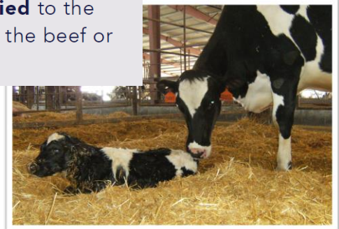
VEAL QUALITY ASSURANCE CERTIFICATION PROGRAM 9